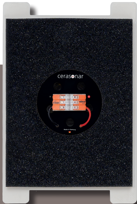
cerasonar 1520 fit